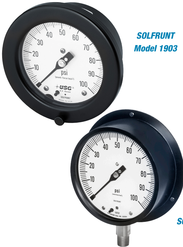
SOLFRUNT Model 1903

Series 1900 6" SOLFRUNT gauges are used where the distance between operator and gauge requires expanded dial graduations for increased readability. Panel or stem mounted, these gauges offer the same rugged construction, accuracy and calibration features as the 4-1/2" series.