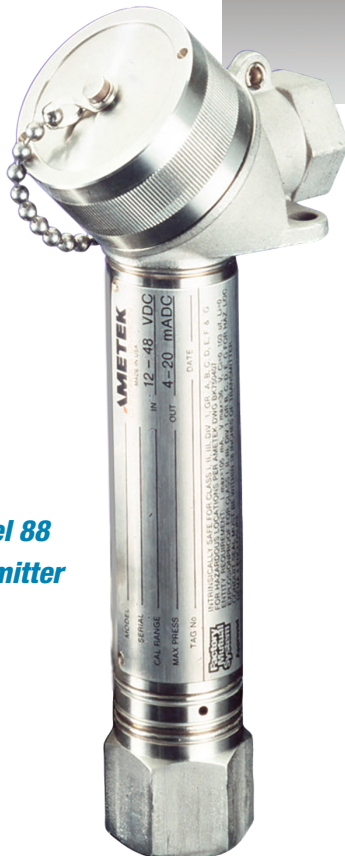
Model 88 Transmitter